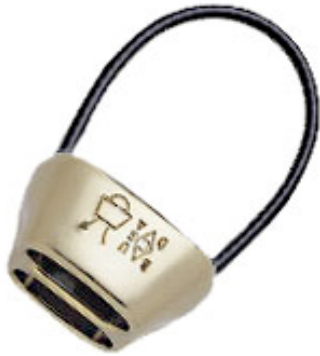
Black Diamond® ATC